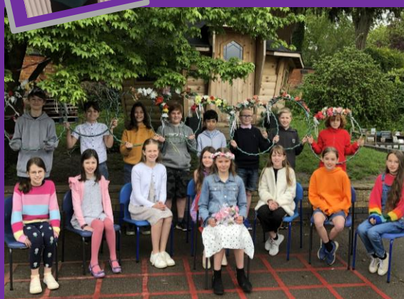
May Monarch 2021

News: The highlight of the week was undoubtedly the School Association's Bubble Fete, which was a wonderful, Covid-alternative to our traditional May Fete fundraiser. The day began with the Year 6 Parade and the crowning of the May Monarch, followed by traditional outdoor fete games, lucky dip, exciting arts and crafts and lots of treats! Thank you to all the supporters of the School Association for giving their time and for organizing such a lovely day for the children.