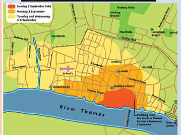
Map of the Fire Spread