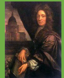
Sir Christopher Wren