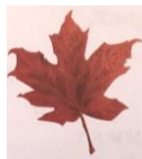
Clipston School Association Autumn Village Trail £1